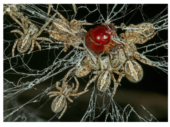
Fig. 1: a. Map of the study area at Christ College, Irinjalakuda (red spots = social spider web colonies); b. distribution of colony in Eugenia uniflora ; c. an individual colony of S. sarasinorum ; d. immobilization of the prey

branches, prey remnants and also their own exuviae into the silk nest. The site identified for the study was on the Christ College campus (10.350°N, 76.200°E, 12 m a.s.l., Fig.1a), located in the town of Irinjalakuda in the Thrissur district in Kerala. The study was undertaken during the period of June–September 2017. The observations were made in the field (Fig. 1b-d).